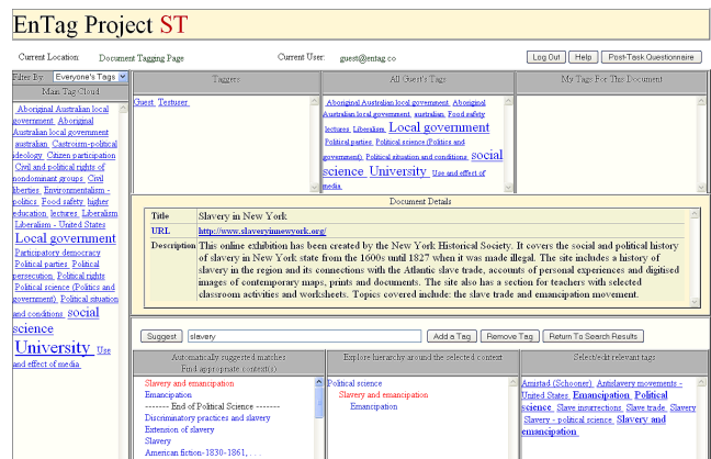
Figure 2. Intute demonstrator's enhanced tagging interface

If the user clicks on one of the listed classes from the first pane, its narrower and broader classes are shown in the second pane ("Explore hierarchy around the selected context"), allowing interactive browsing of the hierarchical context. Simultaneously, in the third pane ("Select/edit relevant tags") a tag-cloud-like list of DDC captions, DDC relative index terms and LCSH mapped terms is presented as a source of suggestions from which the user may select a tag. Selecting a tag copies it to the text box, where it can be further edited; pressing the Tag Document button adds the tag to the document.