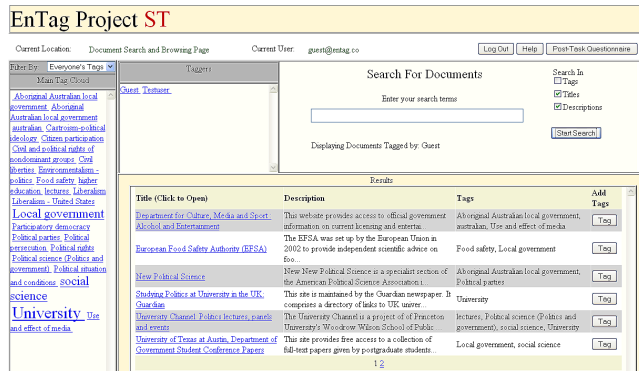
Figure 1. Intute demonstrator's searching interface

The documents found are shown in the Results pane. They are automatically ranked according to the MySQL full-text natural language search. Title, description (from Intute) and existing tags are shown here. By clicking on the Title, the URL opens in a new window.